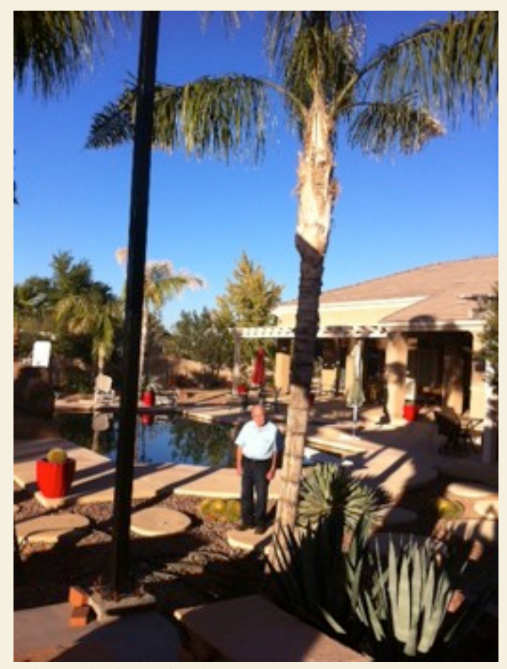
This is the view from our front door.

couldn't imagine making those decisions—I was too loaded down with all the things I had to plan