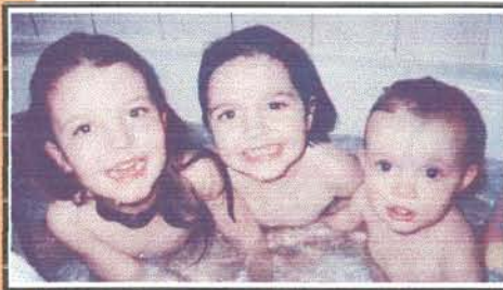
Rub-a-dub-dub, three girls in a tub!!