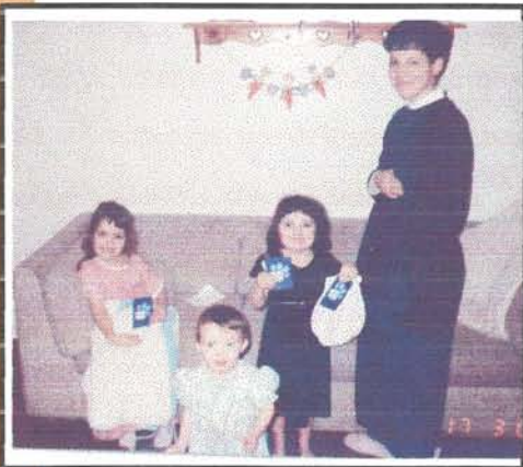
When we told the girls about the baby, we played "Blue's Clues" and hid three paw prints around the house with a burp rag, baby blanket and a bottle. It took them a minute, but they guessed it and were very excited.