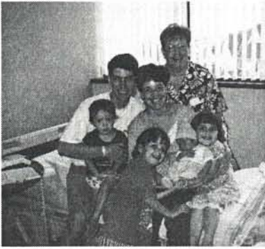
Grandma and family