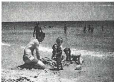
Beach in Rhode Island