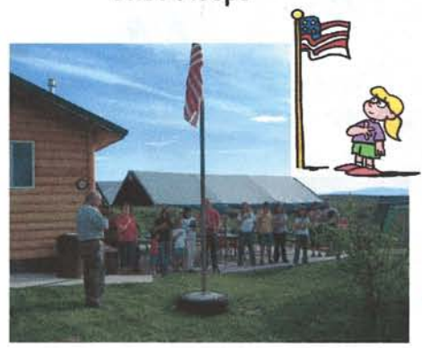
Celebrated July 4