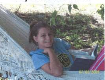
Read and Relaxed