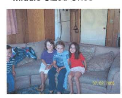
Middle Sized Ones