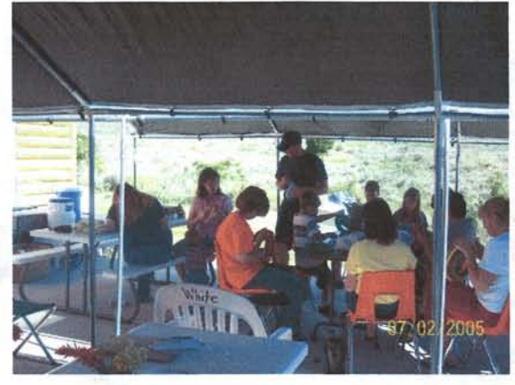
ainting: We painted blocks. ALL colors! We had a regular assembly line going. We discovered talents we didn't know we had. (Like getting paint in unusual places.)