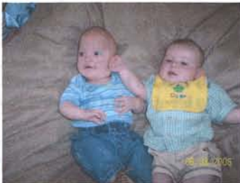
Rix & Riley-Grandma's cute kids