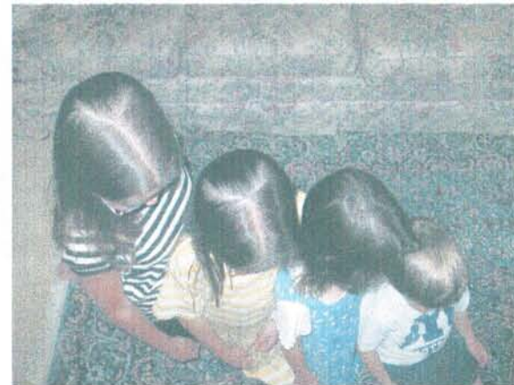
We sent this in to BYU magazine. This picture shows the natural part lines in our kids' hair. Can you tell which two of our children were born while we lived at BYU?