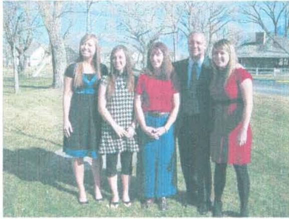
The Burnetts in Utah