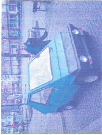
Amy in Germany