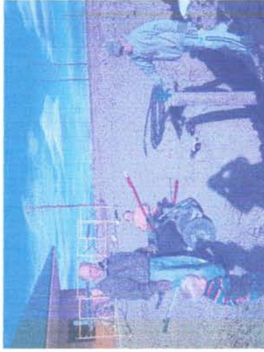
Grandpa and the boys