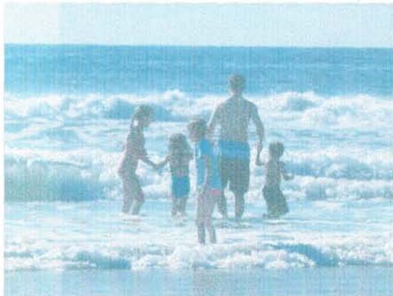
The Coons family at the beach