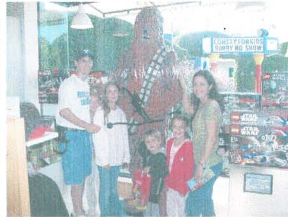
By Chewbacca (made out of legos) at Legoland