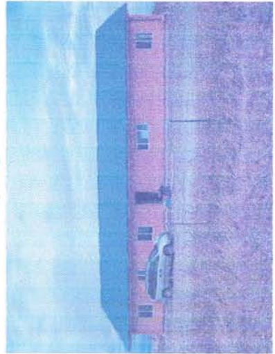
The Sorensens new home!!!