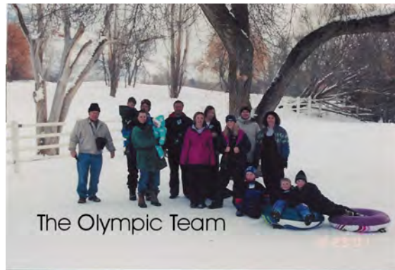
A not-so-candid picture after a hard work-out

We happened on them in the middle of a rigorous practice session December 29, 2001. (They want to get an early start!) They were practicing in a most peculiar place—a golf course in Ogden! Some were more involved than others but they all seemed to be having a great time.