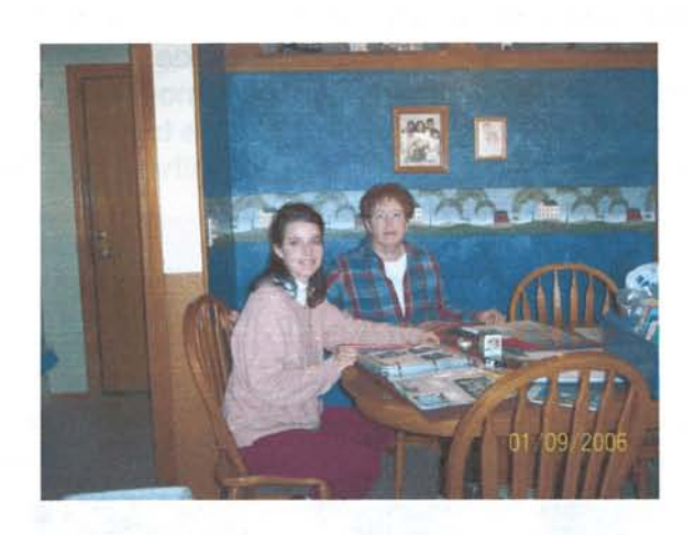
the Moms are Scrapbooking! Thanks, Grandpa