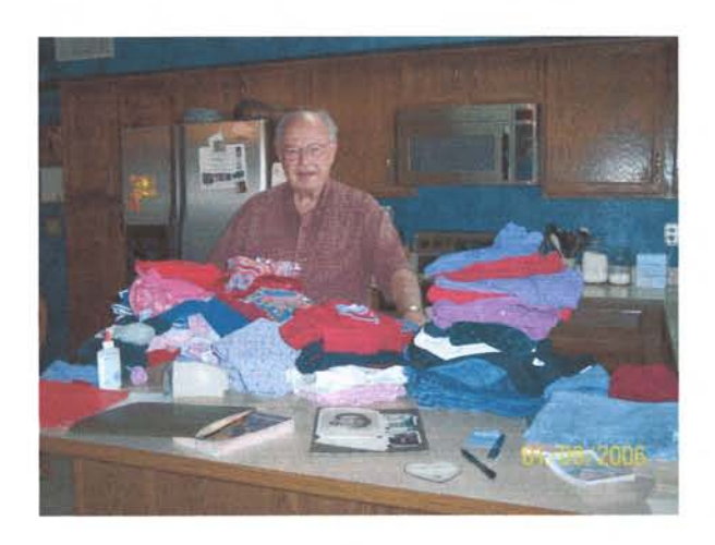
Well, somebody has to fold the clothes while: