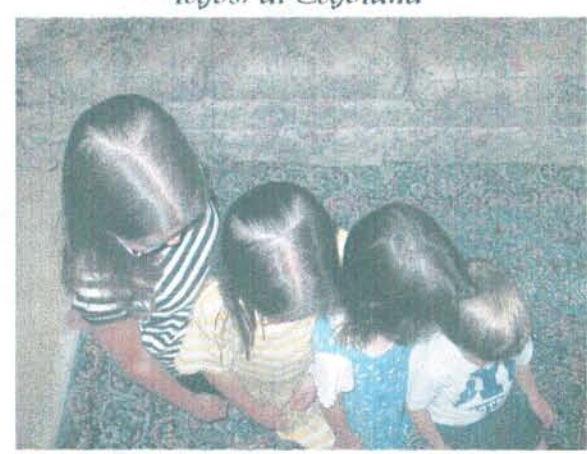
We sent this in to BYU magazine. This picture shows the natural part lines in our kids' hair. Can you tell which two of our children were born while we lived at BYU?