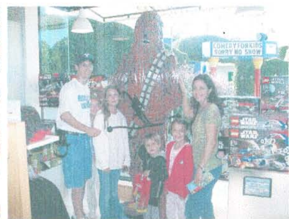
By Chewbacca (made out of legos) at Cegoland