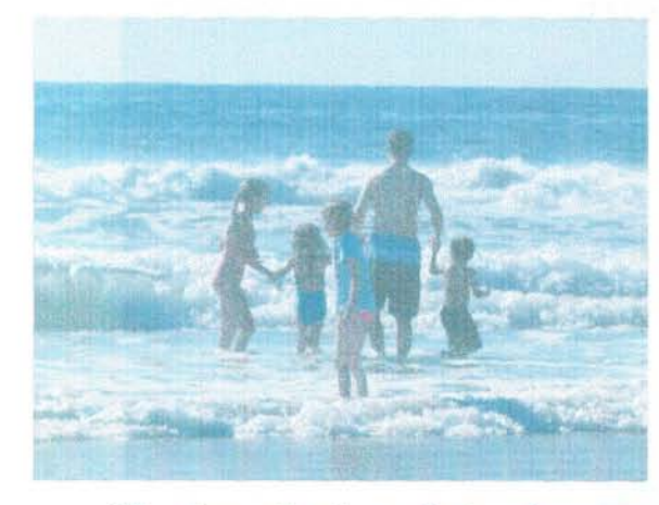
The Coons family at the beach