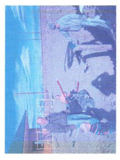
Grandpa and the boys