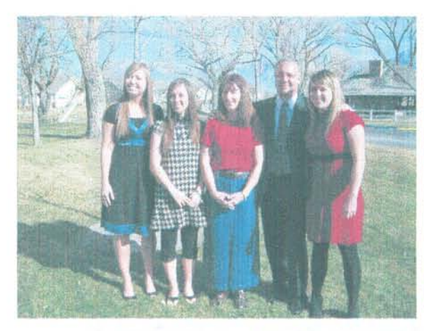
The Burnetts in Utah