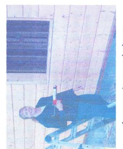
Cana working on the house