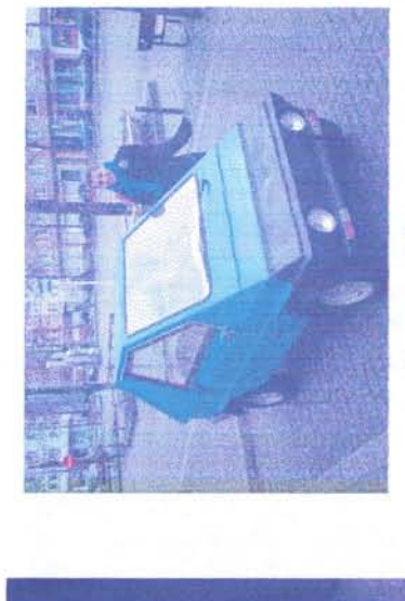
Amy in Germany