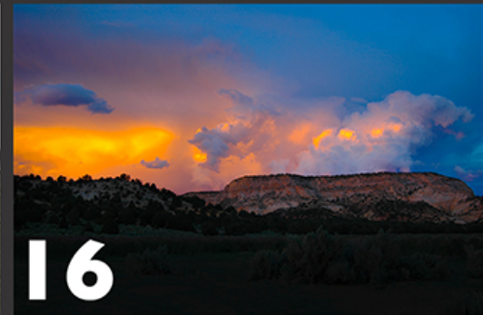
16 11.8 mi On the right: Beautiful sunsets and night skies