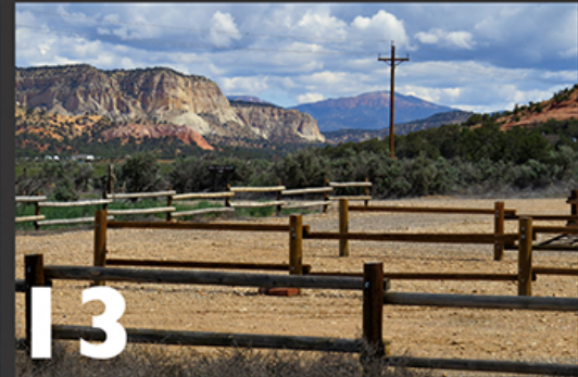
13 9.1 mi On the right: Nephi Pasture 4wd Trailhead