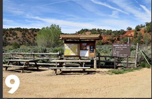
9 7.5 mi On the left: Crocodile/Hog Canyon trailhead and picnicing