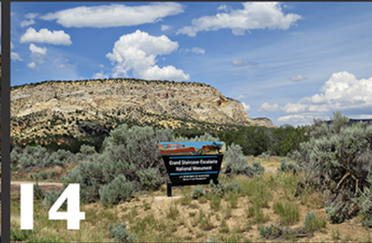
14 11 mi Escalante Grand Staircase, the canyon to Montezuma's Cave

Johnson Canyon is a delightful scenic drive that will refresh the soul. You will quickly see why Hollywood used this beautiful canyon as a backdrop for several movies. After turning onto Johnson Canyon Road, stop and reset your car's trip meter to 0.0 miles and enjoy your drive to the following sites. Most points of interest are on private property, but can be easily enjoyed from the road. Bring binoculars to view the Indian and cowboy glyphs. The tour ends where the pavement turns to dirt. Turn around and enjoy again the sites of Johnson Canyon.