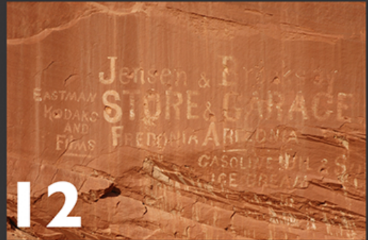
12 7.9 mi On the right: "Pioneer billboard" and "Indian Writings"