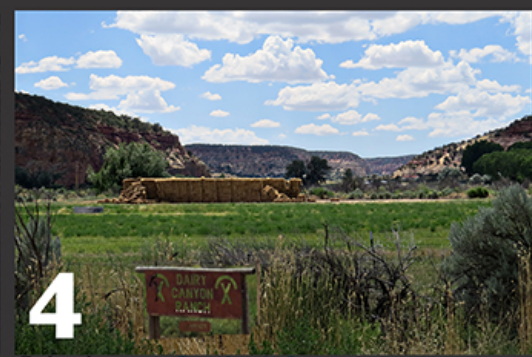
4 5.4 mi On the left: Dairy Canyon