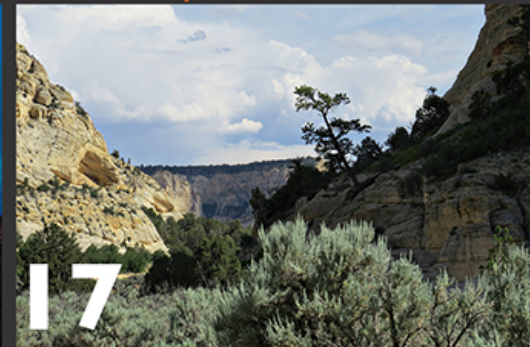
17 15.4 mi The right: End of pavement, beginning of backcountry adventure