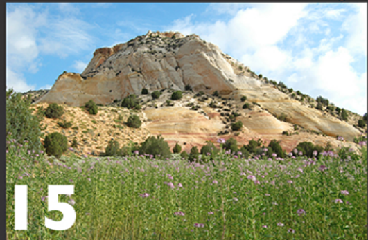
15 11.8 mi On the left: Swapp Canyon

HIGHLIGHTS: #4- Dairy Canyon. Several important Indian artifacts have been found in this area and can be seen at the Kanab Heritage Museum in Kanab (260 North 200 W). Check with Visitor Center for times. #5- "Gunsmoke Set". In years past these movie sets were used for several 'Westerns', including several episodes of the popular "Gunsmoke" TV series. Now a wonderful photographic subject. #9 & #13- These ATV/OHV trailheads are the gateway to some great off-road adventures. #14- In 1914 Freddie Crystal rode into Kanab with a map that indicated that Montezuma had secreted his treasures to a cave in this canyon. Locals pitched tents and began digging. They discovered multiple chambers, side passages, artifacts and petroglyphs but alas, no gold in those White Cliffs. Yet, the legend continues. #14- The Grand Staircase-Escalante National Monument. You are now entering the southern boundary of the largest National Monument in America. Almost 2 million acres of backcountry adventures: slot canyons, dinosaur fossils, canyoneering, and solitude.