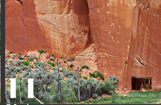
11 7.9 mi On the right: "Indian Writings" and "Cowboy Glyphs"