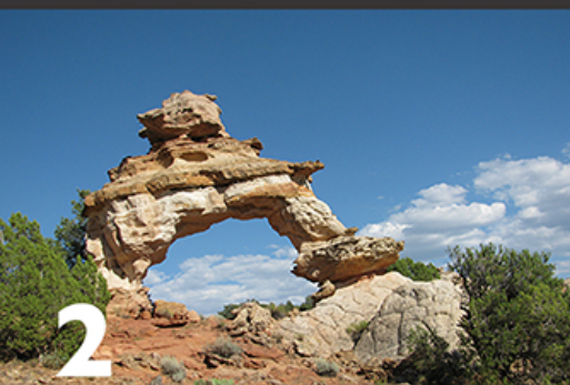
3.1 mi On the right: "Eagle Gate Arch"