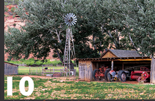
10 7.9 miles On the right: Bunting Ranches