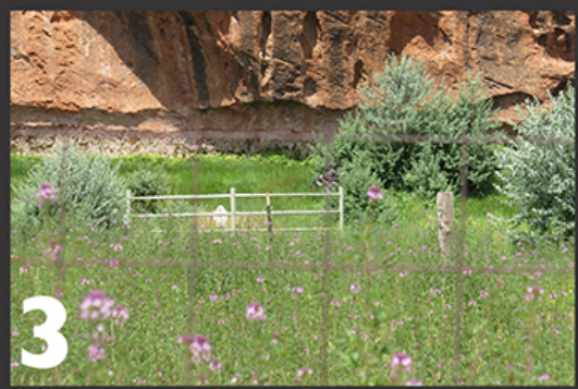
3 3.6 mi On the right: Pioneer grave