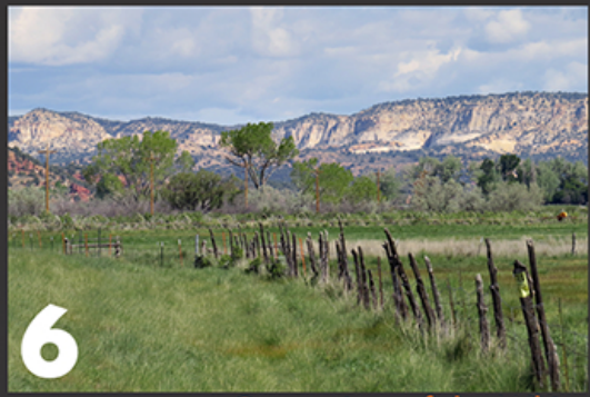
6 Great view of the White Mountains