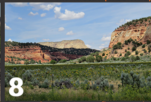
8 7.0 mi On the right: Sunflowers in the summer fields