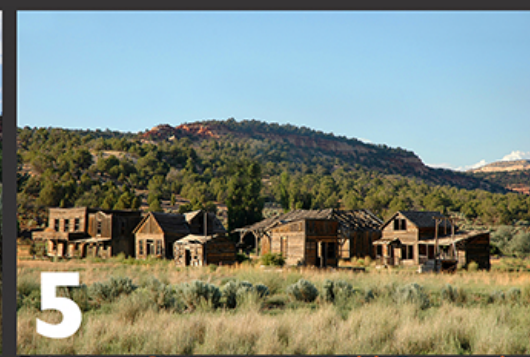
5 5.4 mi On the right: "Old Gunsmoke Movie Set" (1955-1975)