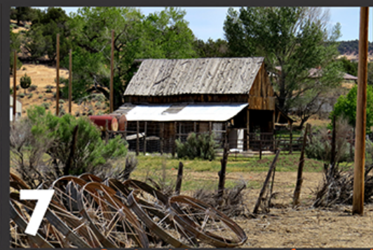
7 5.5 mi On the right: Pioneer farm and equipment