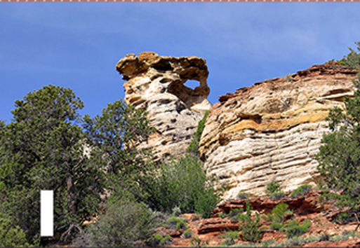
2.6 mi On the left: The "Lion's Head"