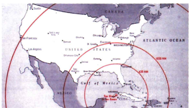
The proximity of Cuba made this a “crisis”.

On October 14th 1962, an American U2 spy plane flying reconnaissance photographed Soviet Missile Sites in Cuba. The next day President Kennedy was informed of the presence of missiles capable of delivering nuclear warheads to major U.S. cities and killing millions of Americans in minutes.