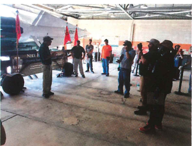
Volunteers educate visitors and maintain the site for future generations.

In 2004, by the effort of a Nike Veteran, Nike Missile Site HM-69 was listed on the National Register of Historic Places.