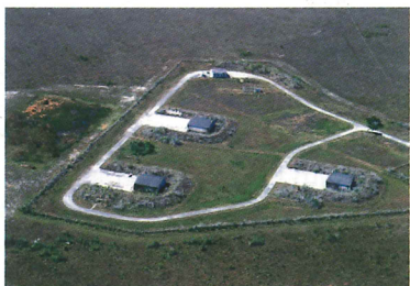
Alpha Battery, Launcher Area at Everglades National Park

Everglades National Park houses one of the best preserved relics of the Cold War in Florida. A historic Nike Hercules Missile Base, dubbed HM-69, remains virtually the same as it was when official use of the site was terminated in 1979.