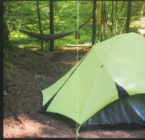
Camp, hike, and explore beneath towering old growth trees.

Old growth forest is the signature of Ohanapecosh. Ancient trees, wildlife, waterfalls, spring wildflowers, and fall mushrooms abound. The Ohanapecosh River—transparent green or blue depending on the light and your perspective—surrounds the Grove of the Patriarchs. Many day hikes begin at Ohanapecosh. Camp or picnic in the campground.