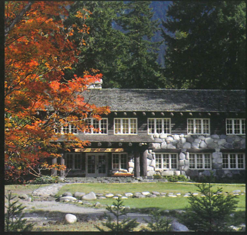
Longmire is a year-round destination.

Accessible year-round. Snowshoe or cross-country ski during winter. Stroll the edge of a meadow where history meets nature. Day hike to expansive vistas. Step back in time; discover rustic park architecture along the Longmire Historic Walking Tour. Stay a night at the historic National Park Inn. From the porch, admire the sunset's glow on the mountain.