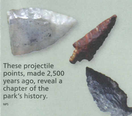
These projectile points, made 2,500 years ago, reveal a chapter of the park's history.

Inspired, mountain clubs, scientists, and communities successfully lobbied Congress to create Mount Rainier National Park in 1899.