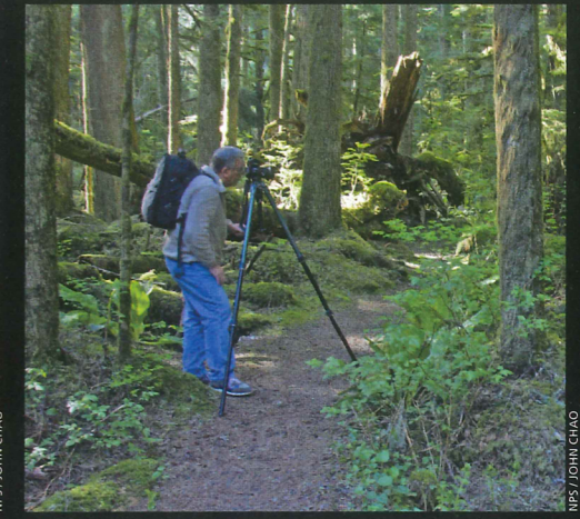
Capture the lush vegetation and giant old growth trees of the rainforest.

Meander moist, moss-carpeted paths through temperate rainforest. Discover the dynamic forces of a glacial river. Mountain-bike a historic road. Spend a night in the backcountry. Visit Mowich Lake—the park's largest and deepest lake. Camp near the lake or enjoy its serenity from a canoe. Fish the deep waters. Hike to subalpine meadows.