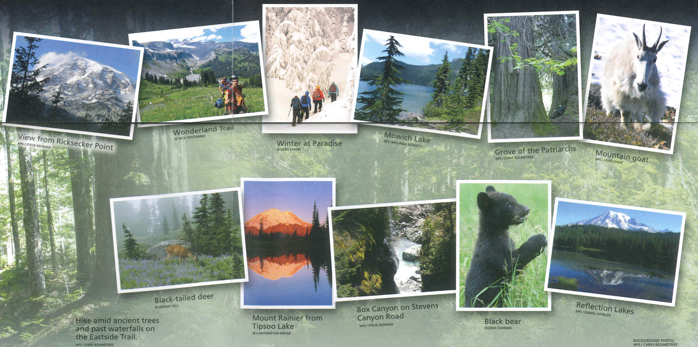
View from Ricksecker Point