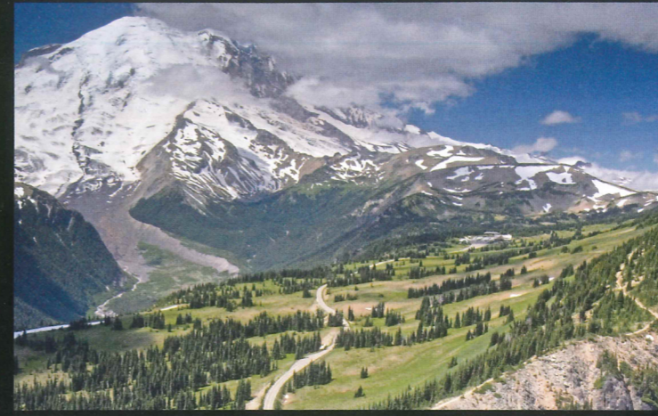
Enjoy unsurpassed, panoramic views while hiking amid resplendent subalpine meadows.

Sunrise, the highest point in the park reachable by car, offers a panoramic view of Mount Rainier and surrounding peaks. Day hikes lead to glaciers, lakes, and meadows. Dig into geology at the visitor center. Discover the rustic architecture and history of Sunrise. Enjoy a snack at the day lodge. Camp nearby at White River Campground.