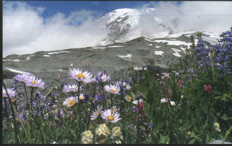
Visit Paradise meadows when they are at their most spectacular.

During summer, hike the maintained trails around meadows, streams, and waterfalls. Watch and listen for wildlife—bears, grouse, butterflies, marmots, and more. Explore exhibits at the visitor and climbing information centers. Rest a night or have a snack at the historic Paradise Inn. Grab a sled and head for Paradise's winter snowplay area, set up a snow camp, ski, or snowboard.