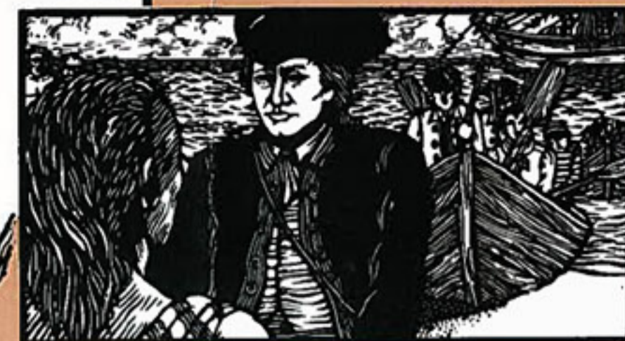
Captain James Cook landing at Waimea, 1778.

15 Mouth of the Waimea River. The first Western contact with Hawaii took place at the mouth of the Waimea River when Captain James Cook anchored there on January 20, 1778. The Hawaiians believed Cook to be their god Lono and prostrated themselves.