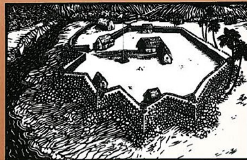
Rendering of Fort Elizabeth upon completion and troop occupation, circa 1820.