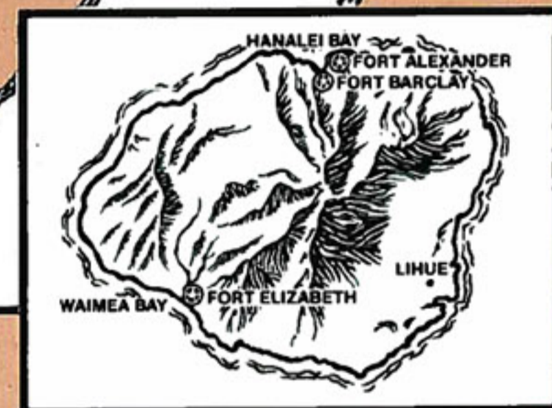
Location of Forts Elizabeth, Alexander and Barclay on Kauai.

17 Kaumualii's Residence. Jackson recorded a number of stacked rock walls and the housesite of King Kaumualii in this area on the seaward portion of the fort. This area was cleared for sugarcane cultivation before 1900.