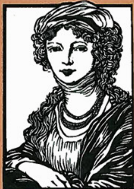
Czarina Elizabeth, wife of Russia's Alexander I, for whom the fort was named in 1816.